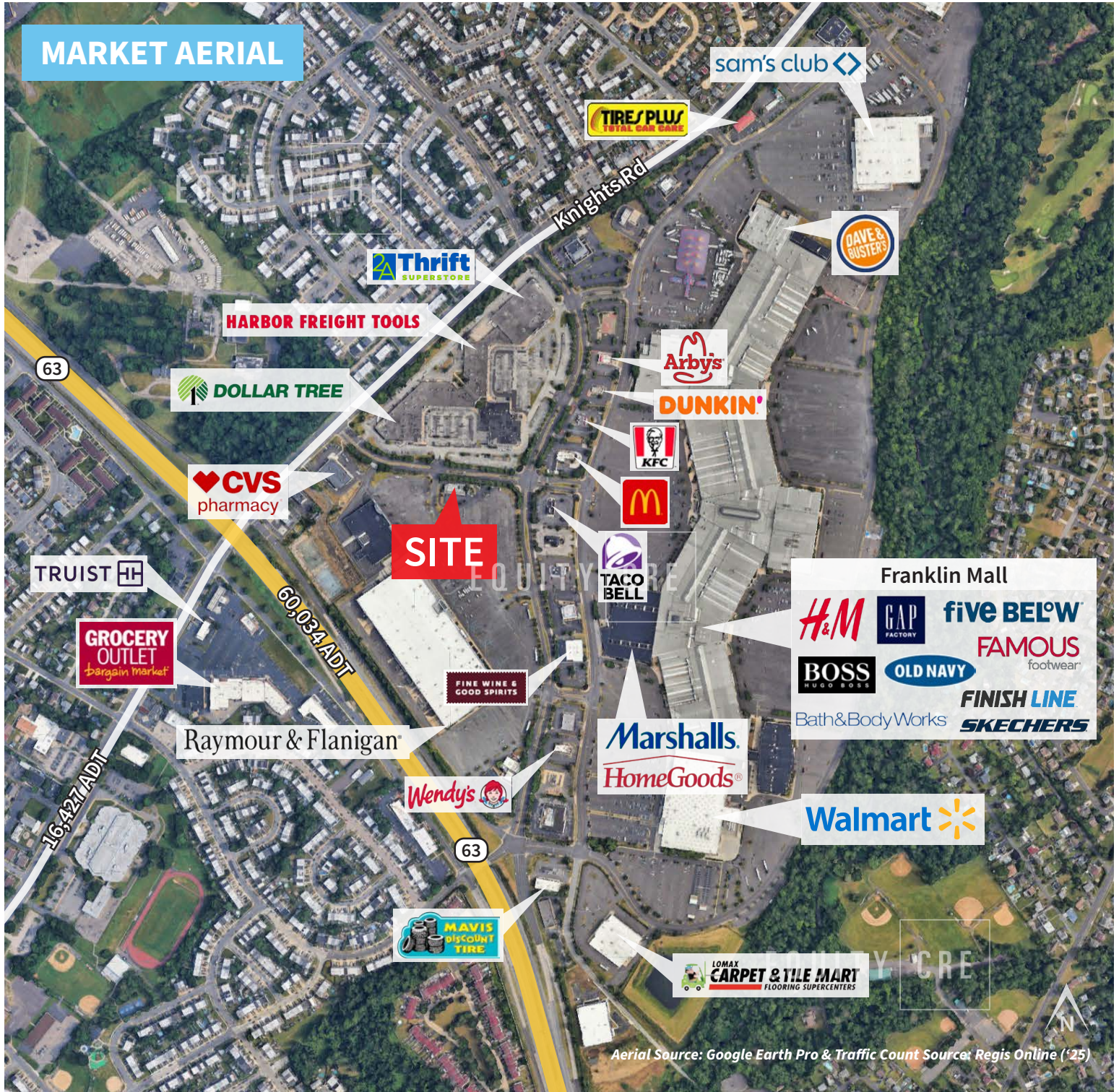
Aerial Source: Google Earth Pro & Traffic Count Source: Regis Online (125)