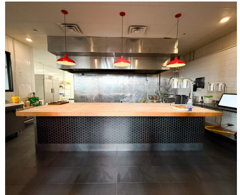
500 SF of Walk-in Refrigerator/Freezer Space