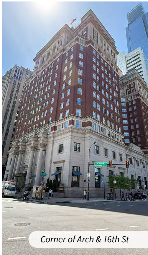
Corner of Arch & 16th St