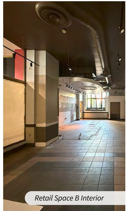
Retail Space B Interior