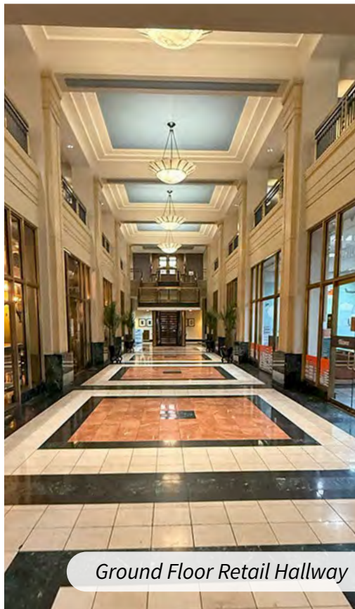
Ground Floor Retail Hallway