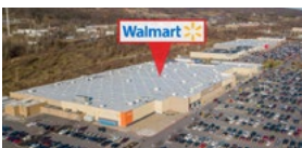
WALMART Dickson City, PA