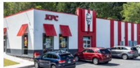
KFC Clarks Summit, PA