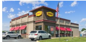
DENNY'S Mid-Atlantic Region