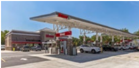
WAWA Franklinville, NJ