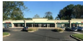
FRAZER TOWNE CENTER Frazer, PA