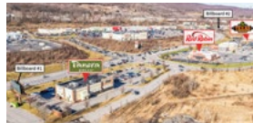
PANERA BREAD, RED ROBIN, & TEXAS ROADHOUSE Dickson City, PA