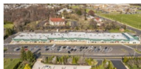
CENTRE PLAZA Bensalem, PA