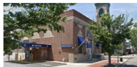
PNC BANK Gloucester City, NJ