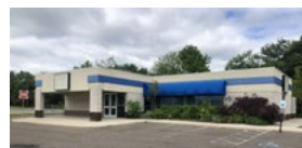
FULTON BANK Sewell, NJ