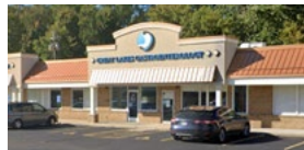
MEDICAL OFFICE Mentor, OH