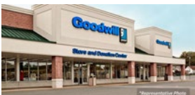
GOODWILL Northeastern PA