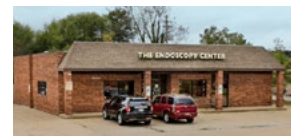
MEDICAL OFFICE Mentor, OH