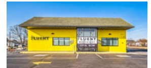
FLUENT DISPENSARY Annville, PA