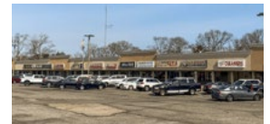
POMONA SHOPPING CENTER Galloway, NJ