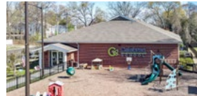
CELEBREE SCHOOL Pasadena, MD