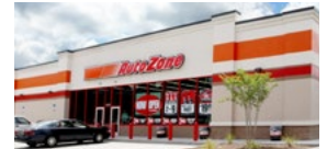
AUTOZONE Wilmington, DE