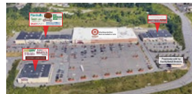
DICKSON CITY COMMONS Dickson City, PA