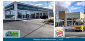
MAVIS DISCOUNT TIRE & BURGER KING Vineland, NJ