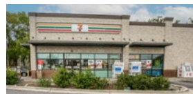
7-ELEVEN Takoma Park, MD