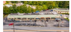
GRANITE PLAZA Media, PA