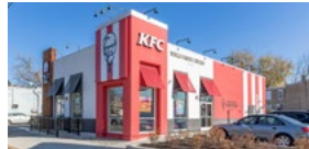
KFC / TACO BELL Wilmington, DE