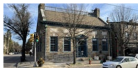
WELLS FARGO Philadelphia, PA