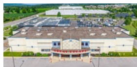
VACANT MOVIE THEATER Muncy Twp (Williamsport), PA