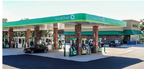
QuickChek, Raritan, NJ