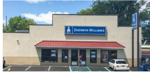
Sherwin Williams, Rahway, NJ