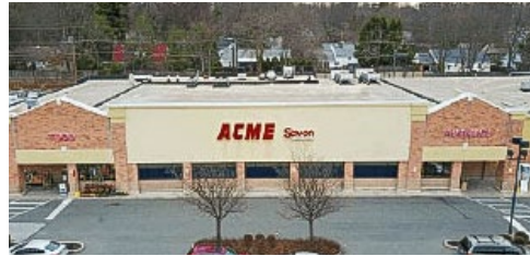
Media Shopping Center, Media, PA