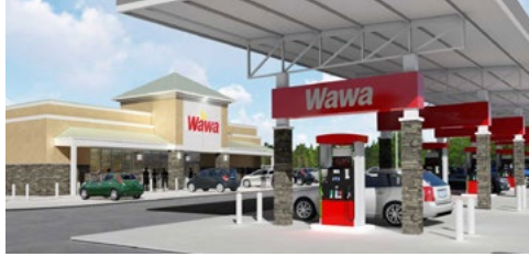
Wawa, Cinnaminson, NJ