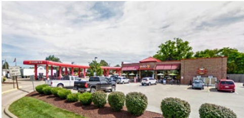
Sheetz, Westmoreland County, PA