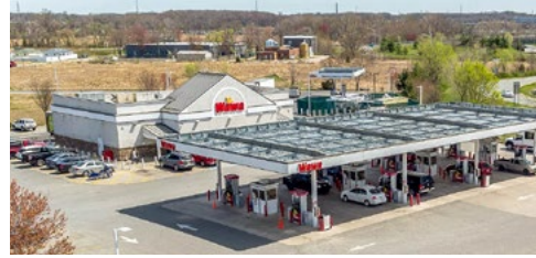
Wawa, Paulsboro, NJ