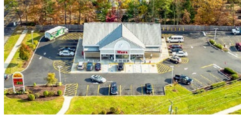
Wawa, Galloway, NJ