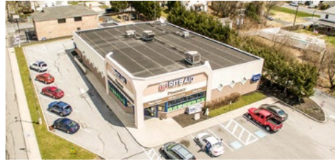
Rite Aid, Harrisburg, PA