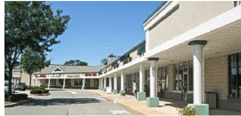
Shoppes at Lionville Station, Exton, PA