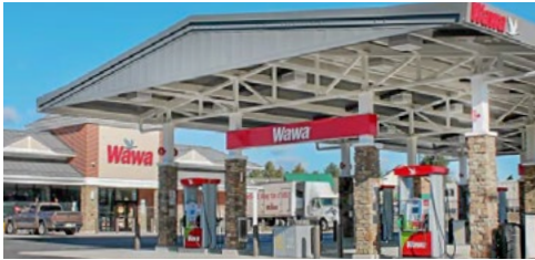
Wawa, Mantua, NJ