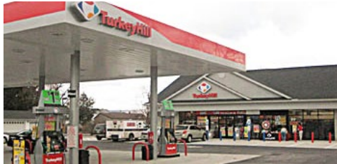
Turkey Hill, Reading, PA