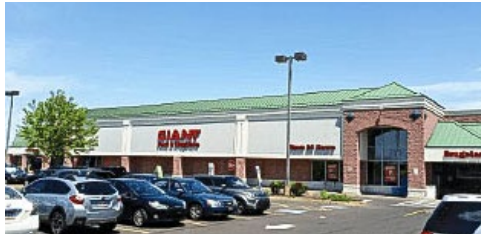
Giant Marketplace, Bensalem, PA