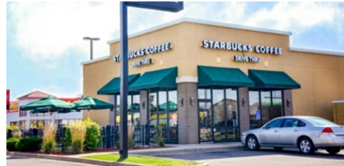
Starbucks, Eau Claire, WI