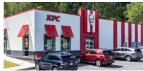
KFC Clarks Summit, PA