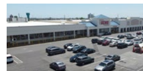
VENTNOR PLAZA Ventnor City, NJ