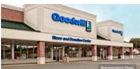
GOODWILL Northeastern PA