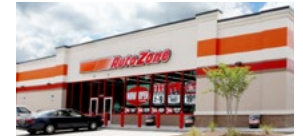
AUTOZONE Wilmington, DE