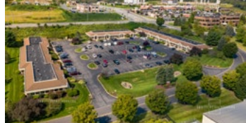
MEDICAL/OFFICE PORTFOLIO PA | Harrisburg/Bethlehem/ Allentown Markets Price: $10,800,000