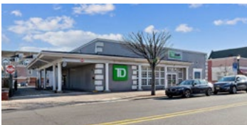
MULTI-TENANT: TD BANK & VACANCY Raritan, NJ Square Footage: ±4,868 Price: $1,500,000