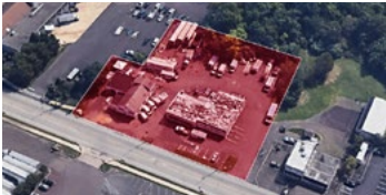
TWO FREE STANDING INDUSTRIAL/FLEX BUILDINGS Lansdale, PA Price: $1,400,000