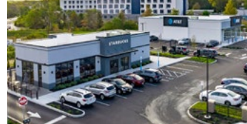
STARBUCKS & AT&T Deptford, NJ Cap Rate: 6.35% Price: $5,456,962