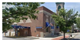
PNC BANK Gloucester City, NJ