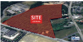
LUDWIGS CORNER | DEVELOPMENT SITE Chester Springs, PA Total Lot Size: ±18 AC Price: Call for information