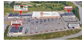
DICKSON CITY COMMONS Dickson City, PA