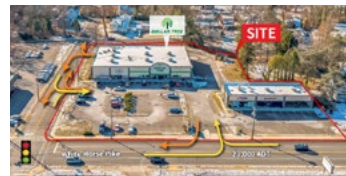
SHOPPING CENTER Clementon, NJ NOI: $304,000 (upon full occupancy) Price: Call for information