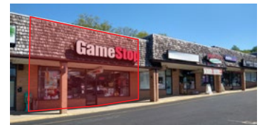
RETAIL CONDOMINIUM Gloucester Township, NJ Square Footage: ±2,288 Price: Call for information