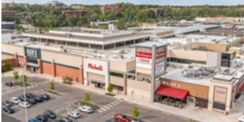
LIFESTYLE CENTER Plymouth Meeting, PA Cap Rate: 5.75% Price: $17,931,304