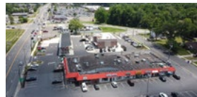
VILLAGE SHOPPES Hammonton, NJ