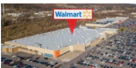
WALMART Dickson City, PA