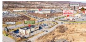
PANERA BREAD, RED ROBIN, & TEXAS ROADHOUSE Dickson City, PA