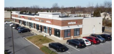
THE SHOPPES AT CROSS KEYS Sicklerville, NJ Cap Rate: 6.76% Price: $4,200,000