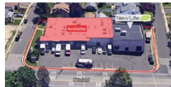
COMMERCIAL BUILDING Willow Grove, PA Square Footage: ±13,585 Price: $1,750,000