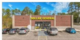
DOLLAR GENERAL Conway, SC