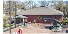
CELEBREE SCHOOL Pasadena, MD