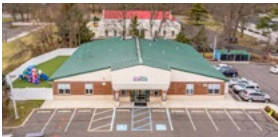
CHILDTIME LEARNING CENTER Moorestown, NJ