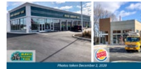
MAVIS DISCOUNT TIRE & BURGER KING Vineland, NJ