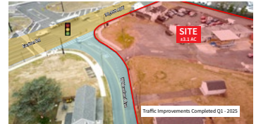
PROPOSED MIXED-USE DEVELOPMENT Horsham, PA Total Lot Size: ±3.1 AC Price: Call for information