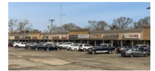
POMONA SHOPPING CENTER Galloway, NJ