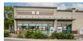
7-ELEVEN Takoma Park, MD