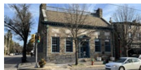
WELLS FARGO Philadelphia, PA