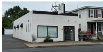
COMMERCIAL/FLEX BUILDING Penndel, PA Square Footage: 1,600 SF Price: $295,000