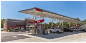
WAWA Franklinville, NJ