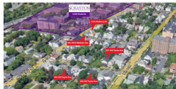
STUDENT HOUSING PORTFOLIO Scranton, PA Cap Rate: 9.03% Price: $2,450,000