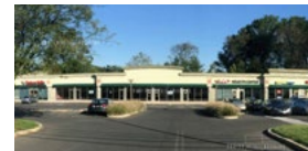
FRAZER TOWNE CENTER Frazer, PA