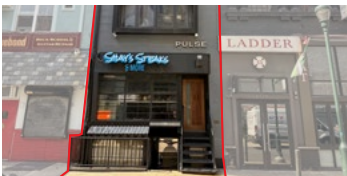
1526 SANSOM STREET Philadelphia, PA Cap Rate: 7.00% Price: $3,375,017