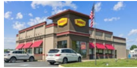
DENNY'S Mid-Atlantic Region