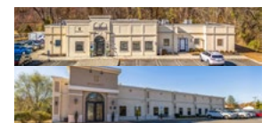
K9 RESORTS Cherry Hill & Hamilton, NJ