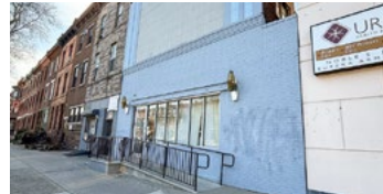
FLEX/OFFICE BUILDING Philadelphia, PA Square Footage: ±7,916 Price: Call for information