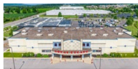
VACANT MOVIE THEATER Muncy Twp (Williamsport), PA