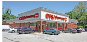
CVS Philadelphia, PA