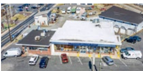
1.67 ACRE MULTI-TENANT Willow Grove, PA