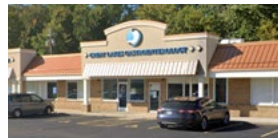
MEDICAL OFFICE Mentor, OH