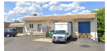
UNIQUE OWNER-USER OPPORTUNITY Willow Grove, PA Square Footage: ±10,825 Price: $1,550,000