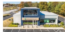
PENN COMMUNITY BANK Lansdale, PA