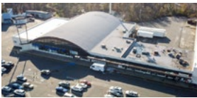
GOODWILL Stratford, NJ