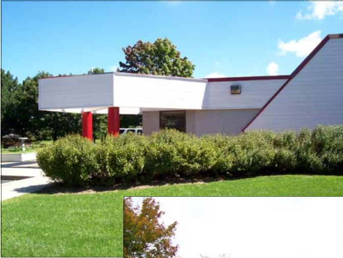
Side and rear views of building