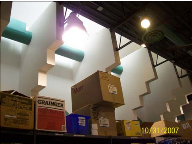
Skylight in general warehouse