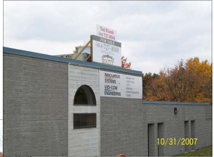
Rooftop Signage visible from I-94