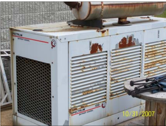
Uninterruptible power supply (generator)